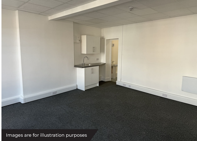
Upstairs Suite – rear 46 High Street, Leighton Buzzard