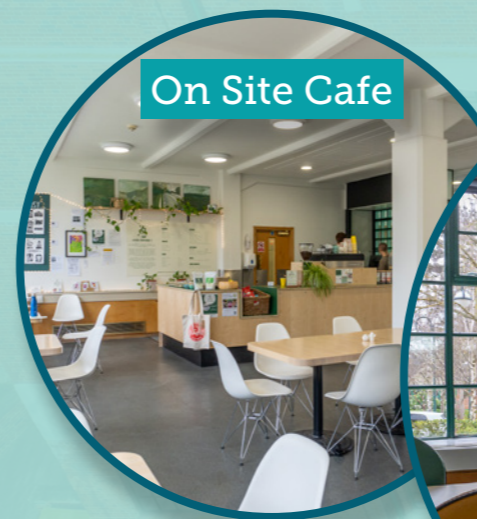
On Site Cafe