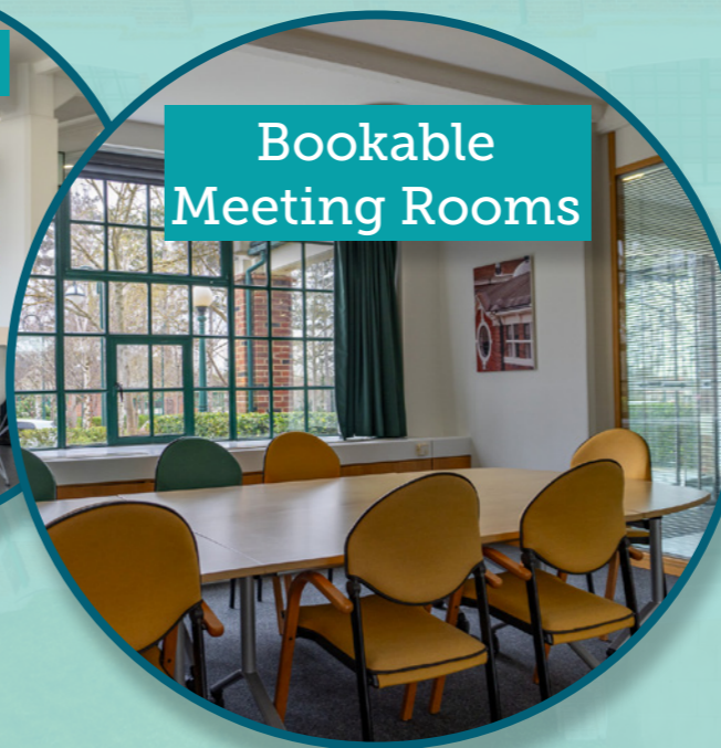
Bookable Meeting Rooms