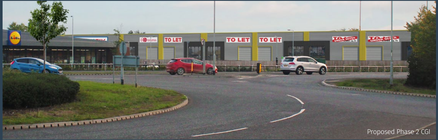
Proposed Phase 2 CGI

Biggleswade Trade Park comprises a terrace of 8 trade counter units.